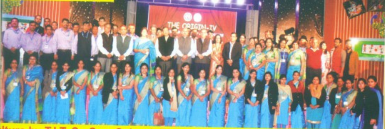
Culture by T.I.T. Sr. Sec. School, Bhiwani and Swar Sangam Team, Kolkata