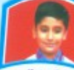
Yardhan 4th A1