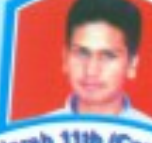
Harsh 11th (Comm.)