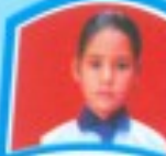
Soina 2nd B