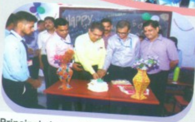
Principal along with the staff members cutting cake & celebrating Teacher's Day