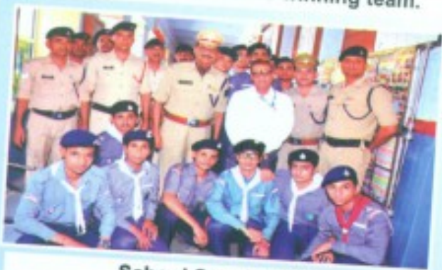
School Scout Team