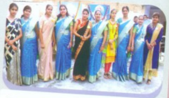
Pupil teachers with their mentors

Teacher's Day is celebrated every year in the memory of Dr. Sarvepalli Radha Krishnan. The students of our school gave tribute to our legendary teachers by reciting poems, stories etc. The class rooms were well decorated by the students. The students posed themselves as their favourite teachers.