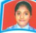
Rashi 7th B