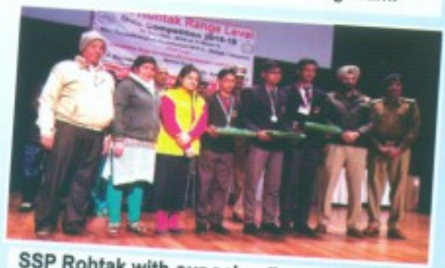
SSP Rohtak with our school's winning team