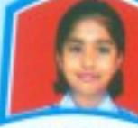
Mahi 6th B