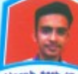
Harsh 11th (Sci.)