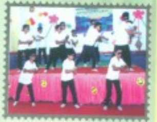
Our students in action during a function on Environment Day (5 June, 2018) at our School